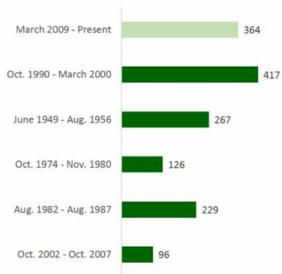
The six largest S&P 500 bull markets, in % return

*As of 7/31/2019