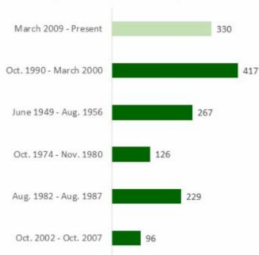
The six largest S&P 500 bull markets, in % return

*As of 2/28/2019